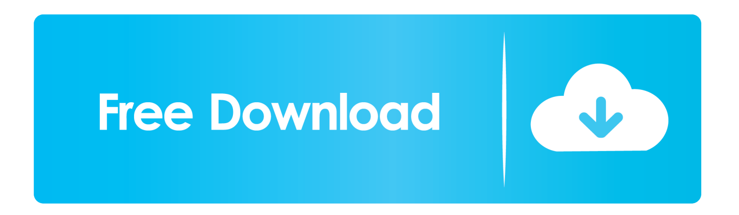
ITools 4.4.5.7 Crack License Key 2020 Full Working [Win Mac]